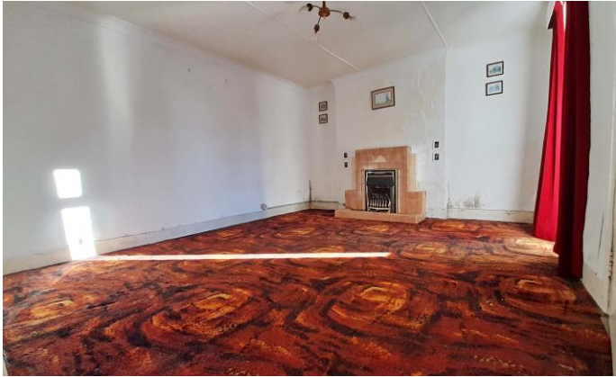
GROUND FLOOR 756 sq.ft. (70.3 sq.m.) approx.

Whilst every care is taken in the preparation of these particulars, their accuracy is not guaranteed and they do not constitute any part of an offer or contract. Any intending purchaser/s must satisfy themselves by inspection or otherwise as to the correctness of these particulars.