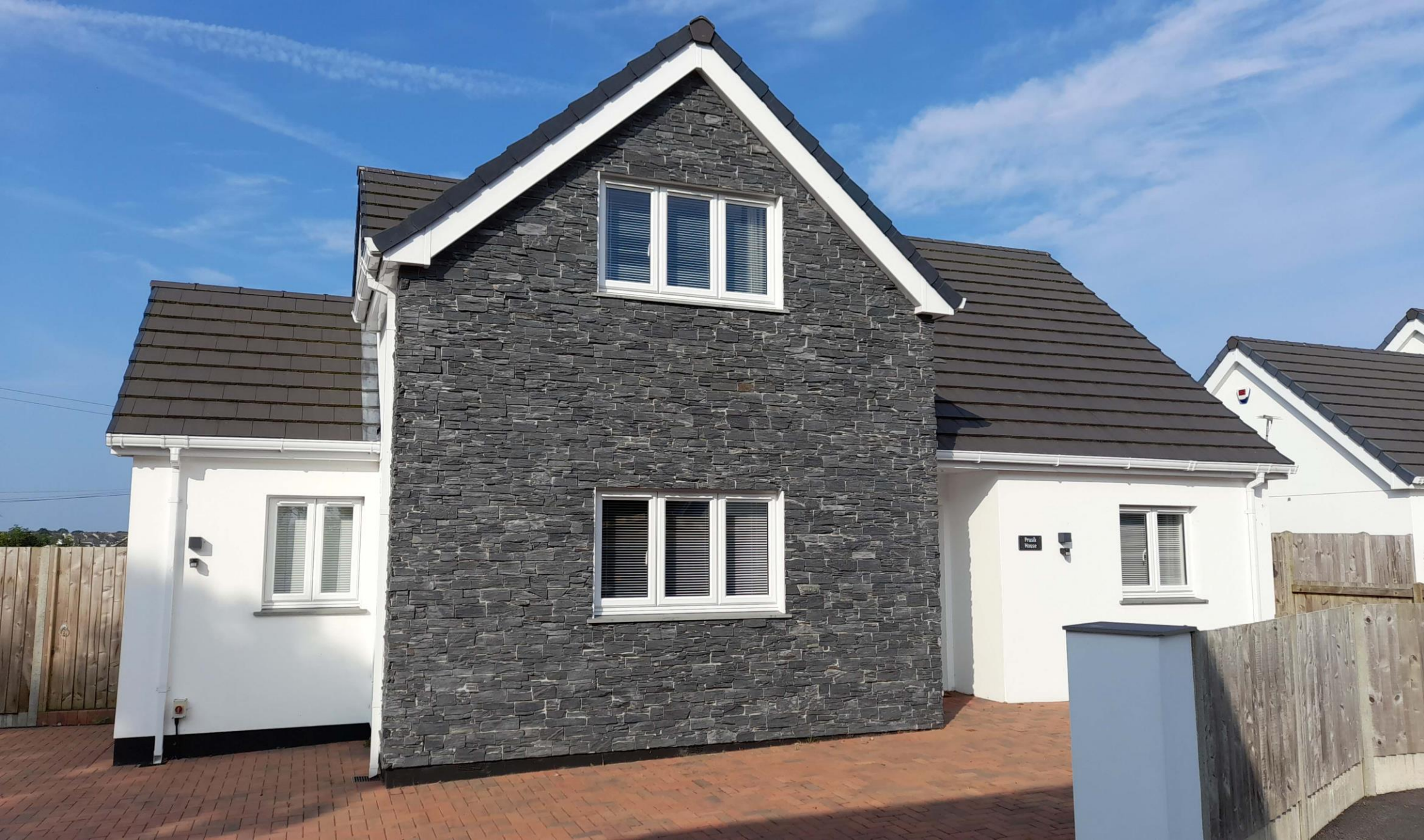
Prusik House, Sparnon Gate, Redruth