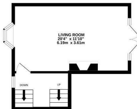
1ST FLOOR 299 sq.ft. (27.8 sq.m.) approx.