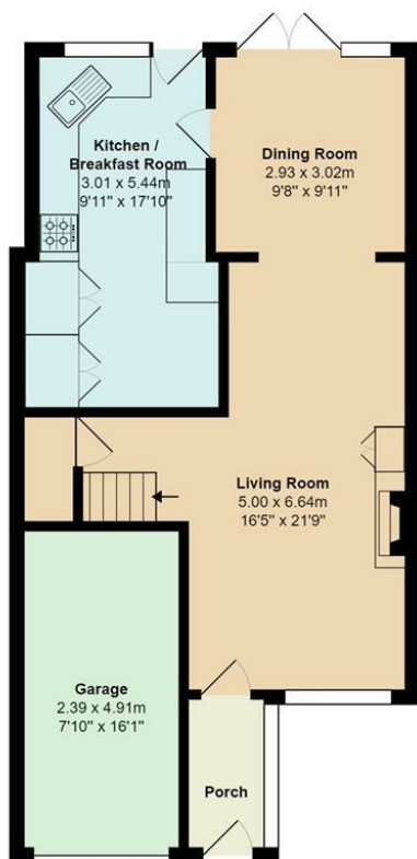
Ground Floor Area: 66.4 m 2 ... 714 ft 2