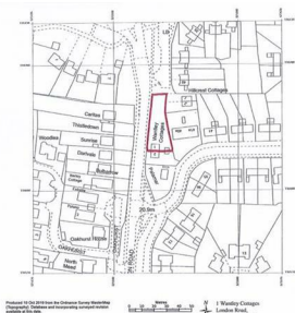
DC/21/2711 - New Dwelling to land adjacent to 1 Wantley Cottages, Henfield

1. All measurements are approximate. 2. Services to the property, appliances and fittings included in the sale are believed to be in working order (although they may have not been checked). 3. Prospective purchasers are advised to arrange their own tests and/or survey before proceeding with the purchase. 4. The agent has not checked the deeds to verify the boundaries. Intending purchasers should satisfy themselves via their solicitor as to the actual boundaries of the property.