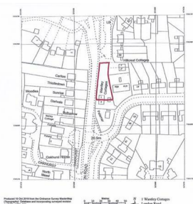
DC/21/2711 - New Dwelling to land adjacent to 1 Wantley Cottages, Henfield

1. All measurements are approximate. 2. Services to the property, appliances and fittings included in the sale are believed to be in working order (although they may have not been checked). 3. Prospective purchasers are advised to arrange their own tests and/or survey before proceeding with the purchase. 4. The agent has not checked the deeds to verify the boundaries. Intending purchasers should satisfy themselves via their solicitor as to the actual boundaries of the property.