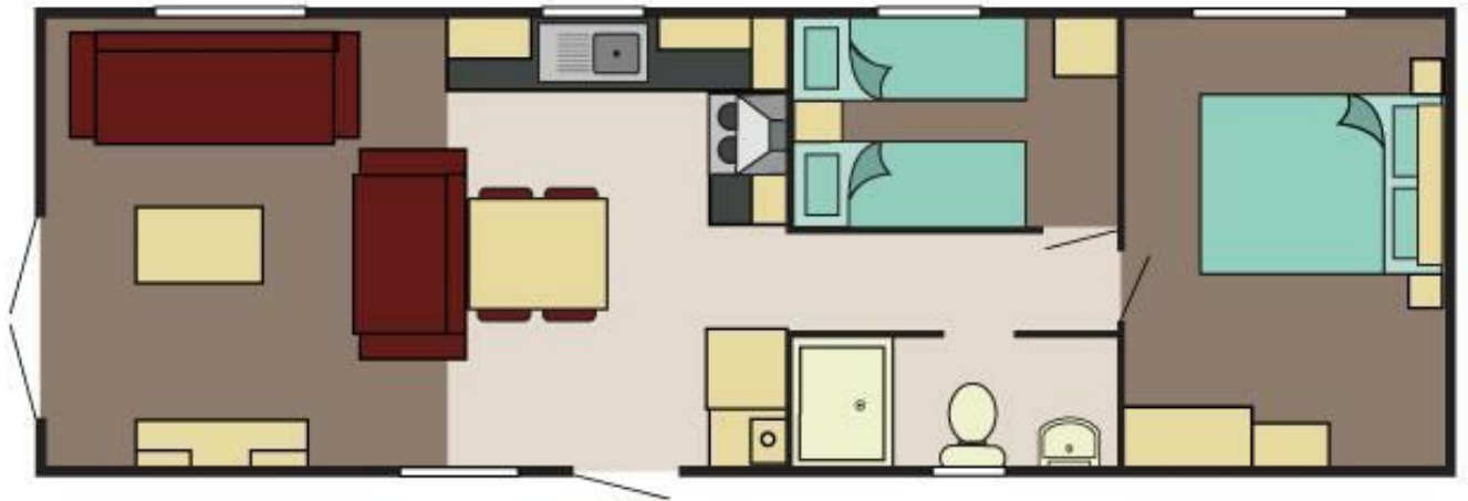
Saffron Deluxe 36x12 2 Bed