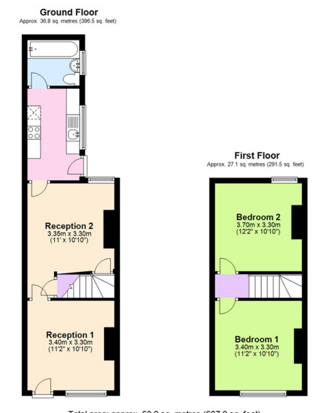
Total area: approx. 63.9 sq. metres (687.9 sq. feet) plan is for illustrative and guidance purposes only and should be used as such by any prospective purchaser. Whilst evenight has been made to ensure the accuracy of this floor plan all measurements of comes, windows, doors and any other terms are approximate and no responsibility is taken by the Appent for any repress, mississions or imagerepersentation.

Viewings are strictly by appointment only via Archer Bassett.