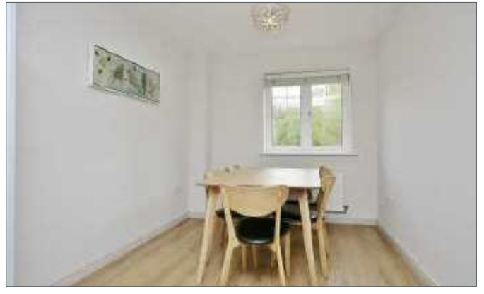
We are pleased to offer a double room for single professional occupancy in a house share with 4 other tenants within a lovely newly-refurbished property, Located in a quiet residential area of Hanwell Fields

The house is in a cul de sac within an easy stroll to local shops including a Co-op. Access to the M40 is quick, and there is a bus stop 100 yards away for a route into the centre of Banbury.