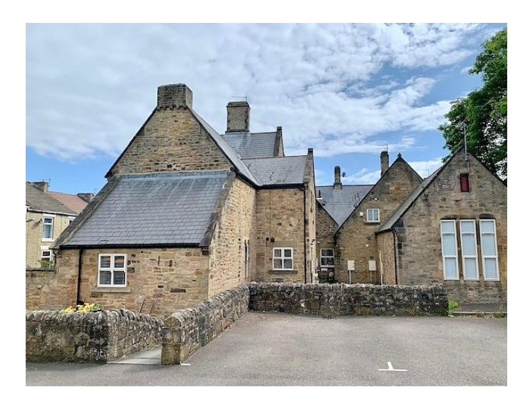
Rear of Apartments

To the front and side of the property there is an enclosed garden which has been gravelled for ease of maintenance. There is a car park for the exclusive use of the building and each property has an allocated parking space.