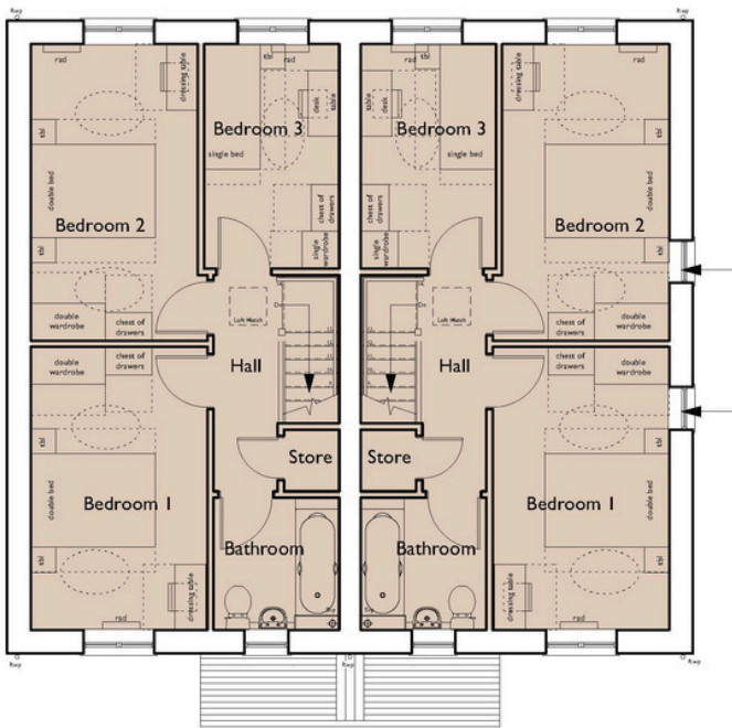
Plot 4 & 11