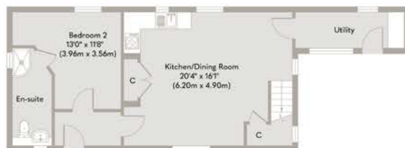
Annexe Ground Floor Approximate Floor Area 601 sq. ft (55.86 sq. m)