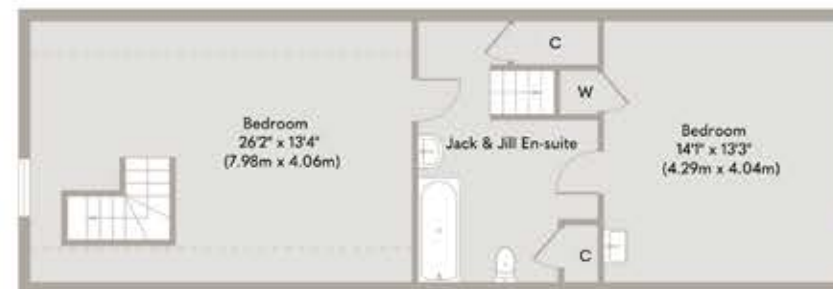
Second Floor Approximate Floor Area 735 sq. ft (68.32 sq. m)