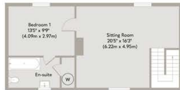
Annexe First Floor Approximate Floor Area 543 sq. ft (50.42 sq. m)