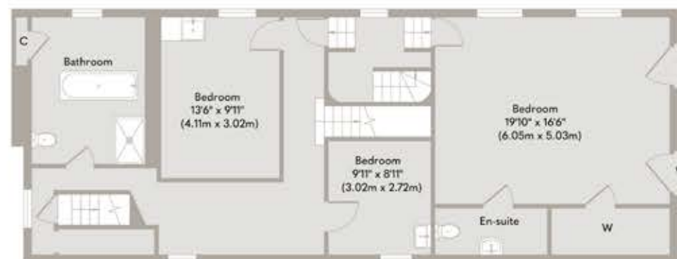
First Floor Approximate Floor Area 1082 sq. ft (100.50 sq. m)