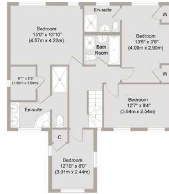
First Floor Approximate Floor Area 821 sq. ft (76.23 sq. m)