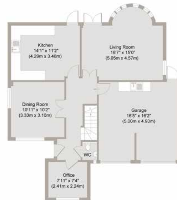
Ground Floor Approximate Floor Area 948 sq. ft (88.11 sq. m)

Whilst every attempt has been made to ensure the accuracy of the floor plan contained here, measurements of doors, windows, rooms and any other items are approximate and no responsibility is taken for any error, omission, or mis-statement. This plan is for illustrative purposes only and should be used as such by any prospective purchaser or tenant. The services, systems and appliances shown have not been tested and no guarantee as to their operability or efficiency can be given.