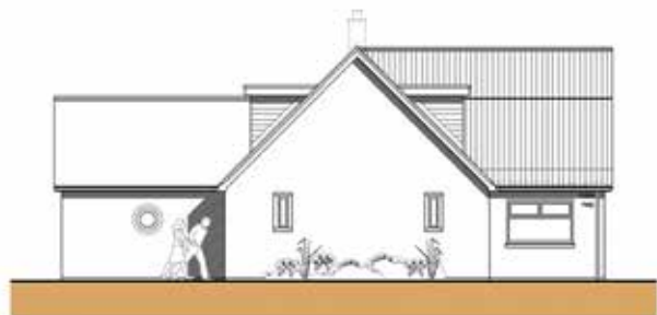
Side Elevation (SW) Scale: 1:100