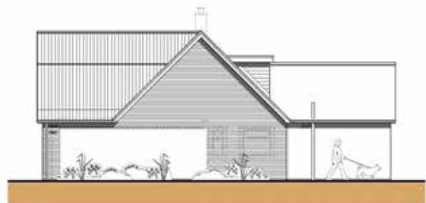
Side Elevation (NE) Scale: 1:100