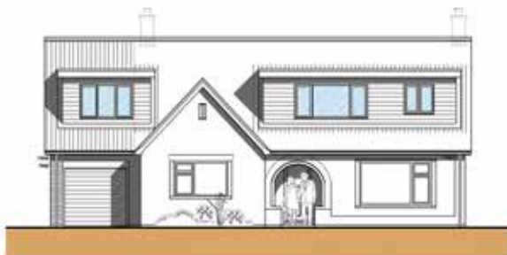
Front Elevation (NW) Scale: 1:100