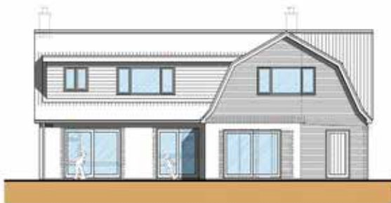
Rear Elevation (SE) Scale: 1:100