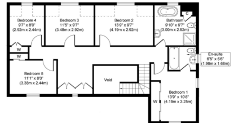
First Floor Approximate Floor Area 1004 sq. ft (93.27 sq. m)