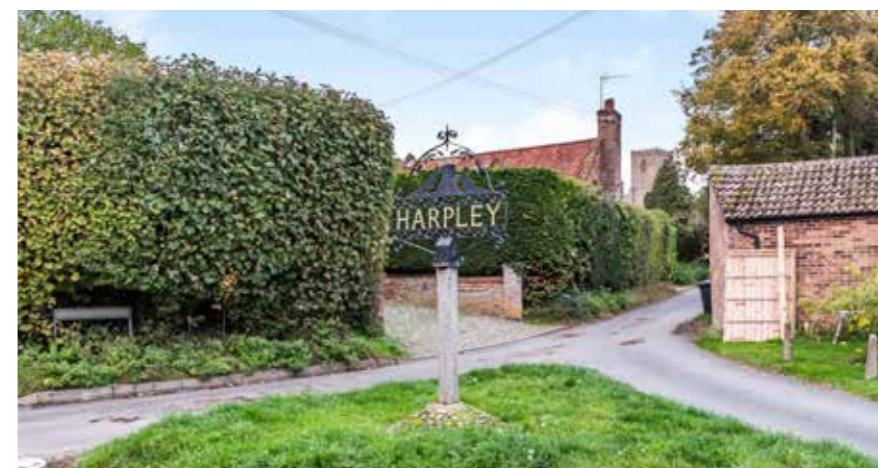
Harpley village sign

“It's a nice circular village, there's a lovely community and some great walks.”