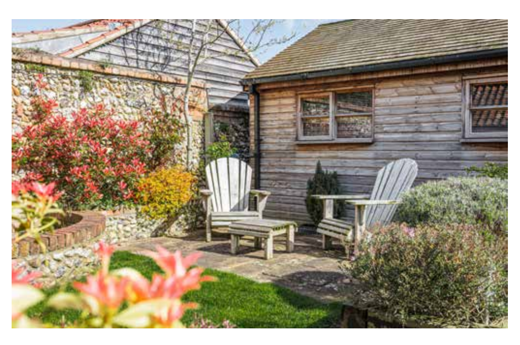
"The garden is a majestic and private space to enjoy."