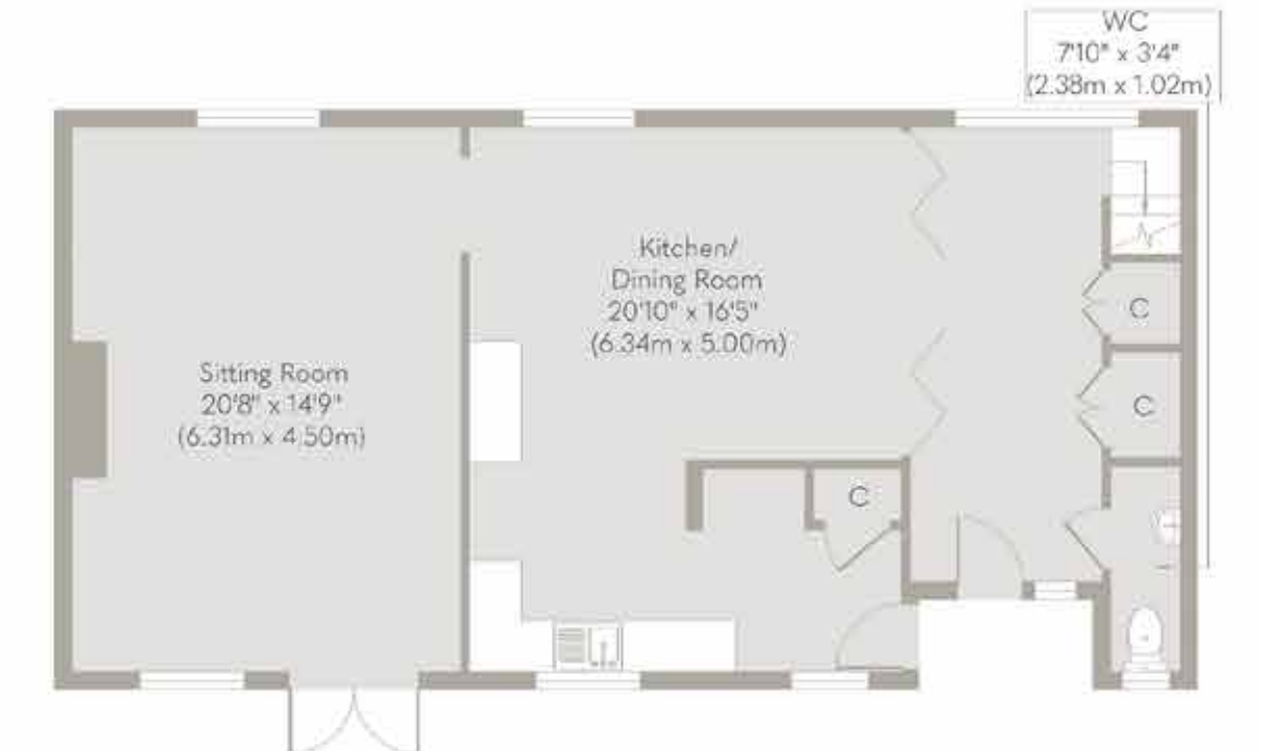
Ground Floor Approximate Floor Area 844 sq. ft (78.37 sq. m)