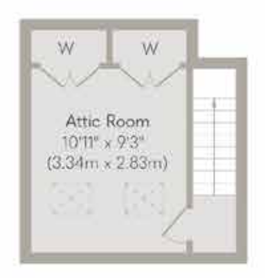
Second Floor Approximate Floor Area 155 sq. ft (14.43 sq. m)