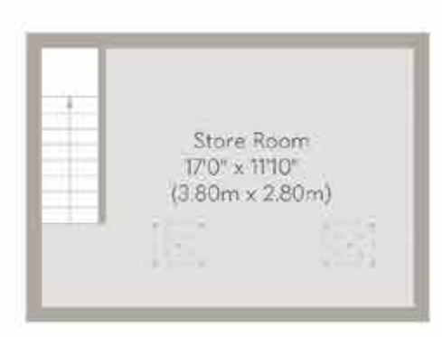
Garage First Floor Approximate Floor Area 202 sq. ft (18.73 sq. m)