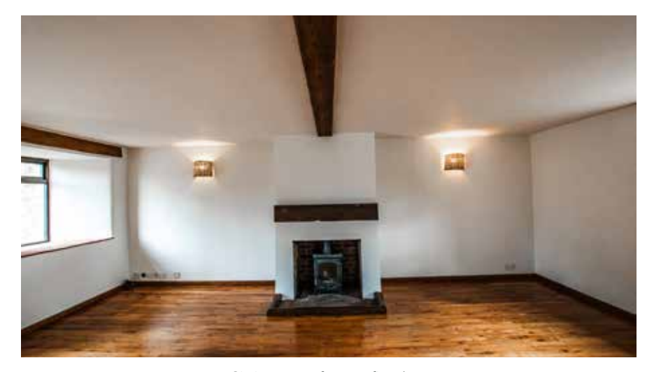
Sitting room feature fireplace

"...timeless allure with modern comforts..."