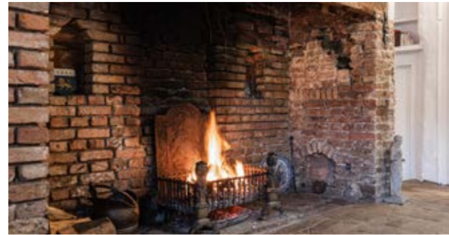
Sitting room inglenook fireplace.

“We love to sit in front of the lit, inglenook fire with a glass of wine, especially at Christmas.”