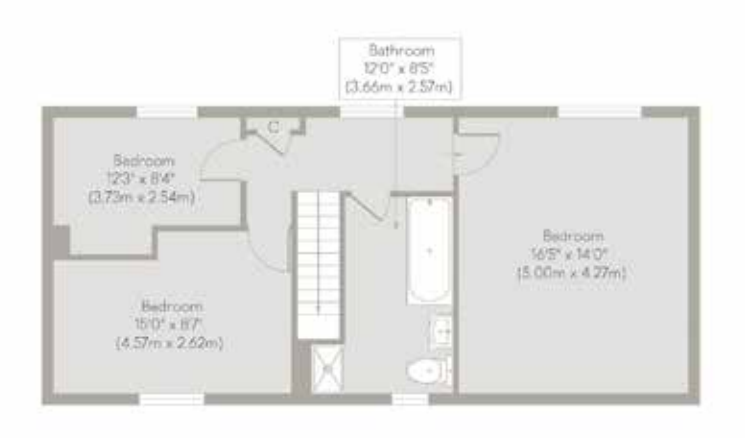
First Floor Approximate Floor Arks 651 sq. ft (60 47 sq. m)