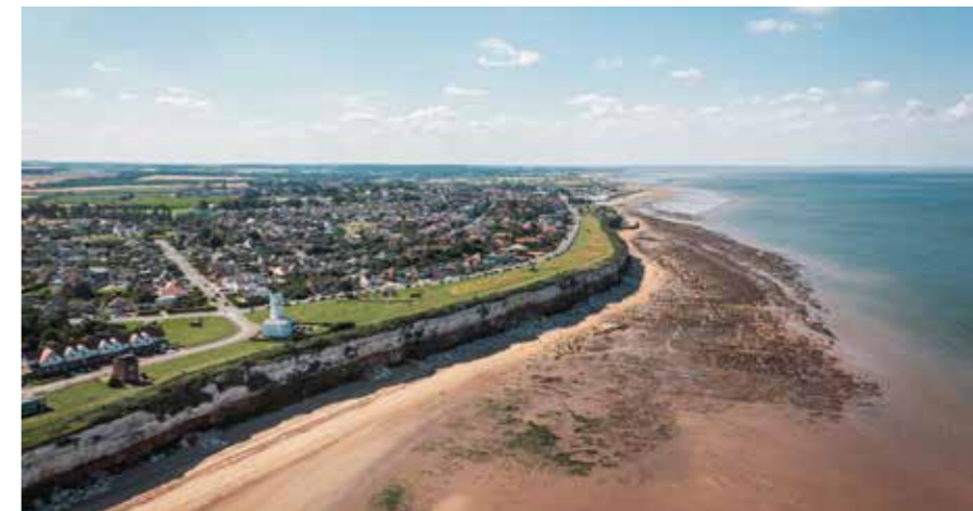
Aerial photograph of Hunstanton

“Hunstanton is so close, and it's one of the places we most enjoy exploring.”