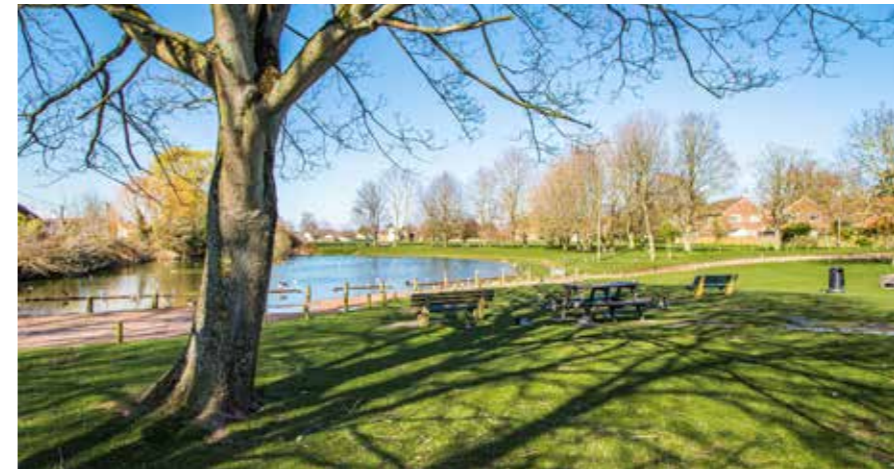
The duck pond at South Wootton.

“The area is peaceful and falls within a good school catchment area.”