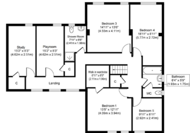
First Floor Approximate Floor Area 1332 sq. ft (123.74 sq. m)

Whilst every attempt has been made to ensure the accuracy of the floor plan contained here, measurements of doors, windows, rooms and any other items are approximate and no responsibility is taken for any error, omission, or mis-statement. This plan is for illustrative purposes only and should be used as such by any prospective purchaser or tenant. The services, systems and appliances shown have not been tested and no guarantee as to their operability or efficiency can be given.