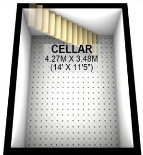
BASEMENT APPROX. 14.9 SQ. METRES (159.9 SQ. FEET)