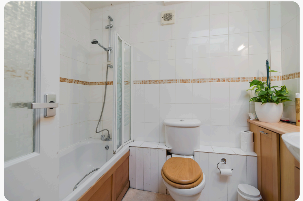
The bathroom has fitted storage, a very useful airing cupboard and a shower over the bath.