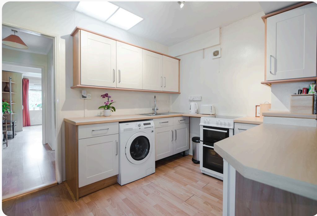
The kitchen has space for a washing machine, fridge, freezer and oven, and the skylight allows natural light to brighten the worksurface area.