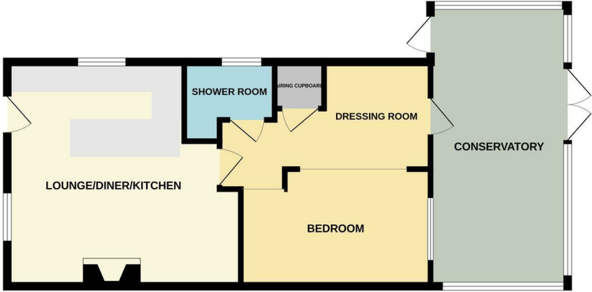
ONE BEDROOM BUNGALOW TOTAL FLOOR AREA : 635 sq.ft. (59.0 sq.m.) approx. Whilst every attempt has been made to ensure the accuracy of the floorplan contained here, measurements of doors, windows, rooms and any other items are approximate and no responsibility is taken for any error, omission or mis-statement. This plan is for illustrative purposes only and should be used as such by any prospective purchaser. The services, systems and appliances shown have not been tested and no guarantee as to their operability or efficiency can be given. Made with Metrepro ©2025.

Littlehampton is a charming seaside town sheltered by the South Downs and providing a range of amenities to suit individuals, couples and families of all ages. The town benefits from two beaches with the popular East Beach providing a long promenade, family fun at Harbour Park, the award winning East Beach café, childrens playground and many other highlights. West Beach offers a quieter experience with the unspoilt grassy sand dunes offering ideal dog walking opportunities as well as watersports for those seeking adventure.