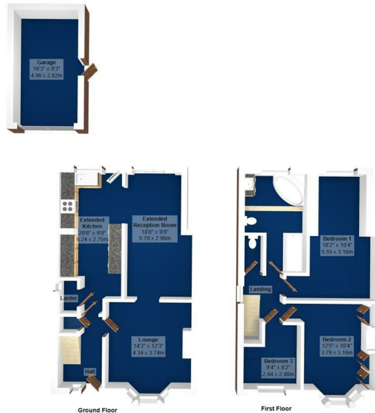
Total Area: 1331 ft 2 ... 123.7 m 2 (Includes Garage) Whilst every attempt has been made to ensure the accuracy of the floor plan contained here, measurements are approximate and no responsibility is taken for error, omission or mis-statement. This plan is for illustrative purposes only and should be used as such by any prospective purchaser. Created by Jan 2024