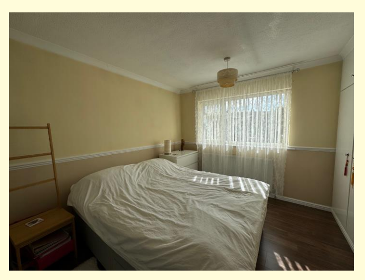
Bedroom Two 12'9" X 16'8" (3.88 X 5.08m)

Laminate flooring, double wardrobe and central heating radiator.