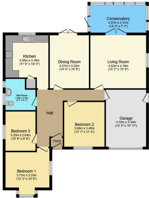
Floor Plan Floor area 131.2 m 2 (1,412 sq.ft.)