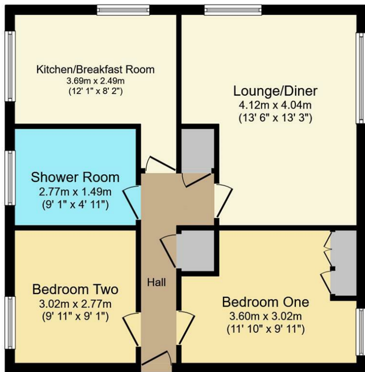
Floor Plan Floor area 61.7 m 2 (664 sq.ft.)