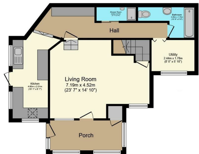
Ground Floor Floor area 61.3 m 2 (660 sq.ft.)