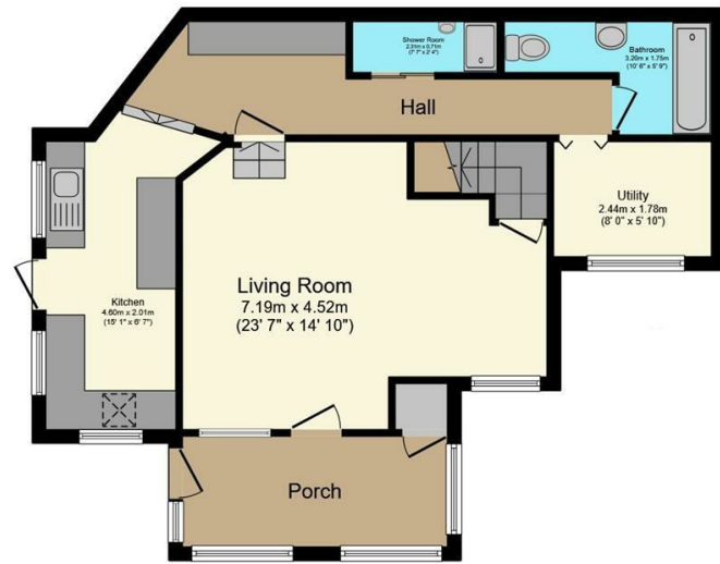
Ground Floor Floor area 61.3 m 2 (660 sq.ft.)