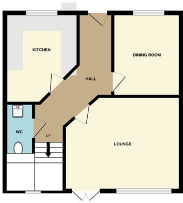
GROUND FLOOR 518 sq.ft. (48.1 sq.m.) approx.