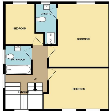
1ST FLOOR 518 sq.ft. (48.1 sq.m.) approx.