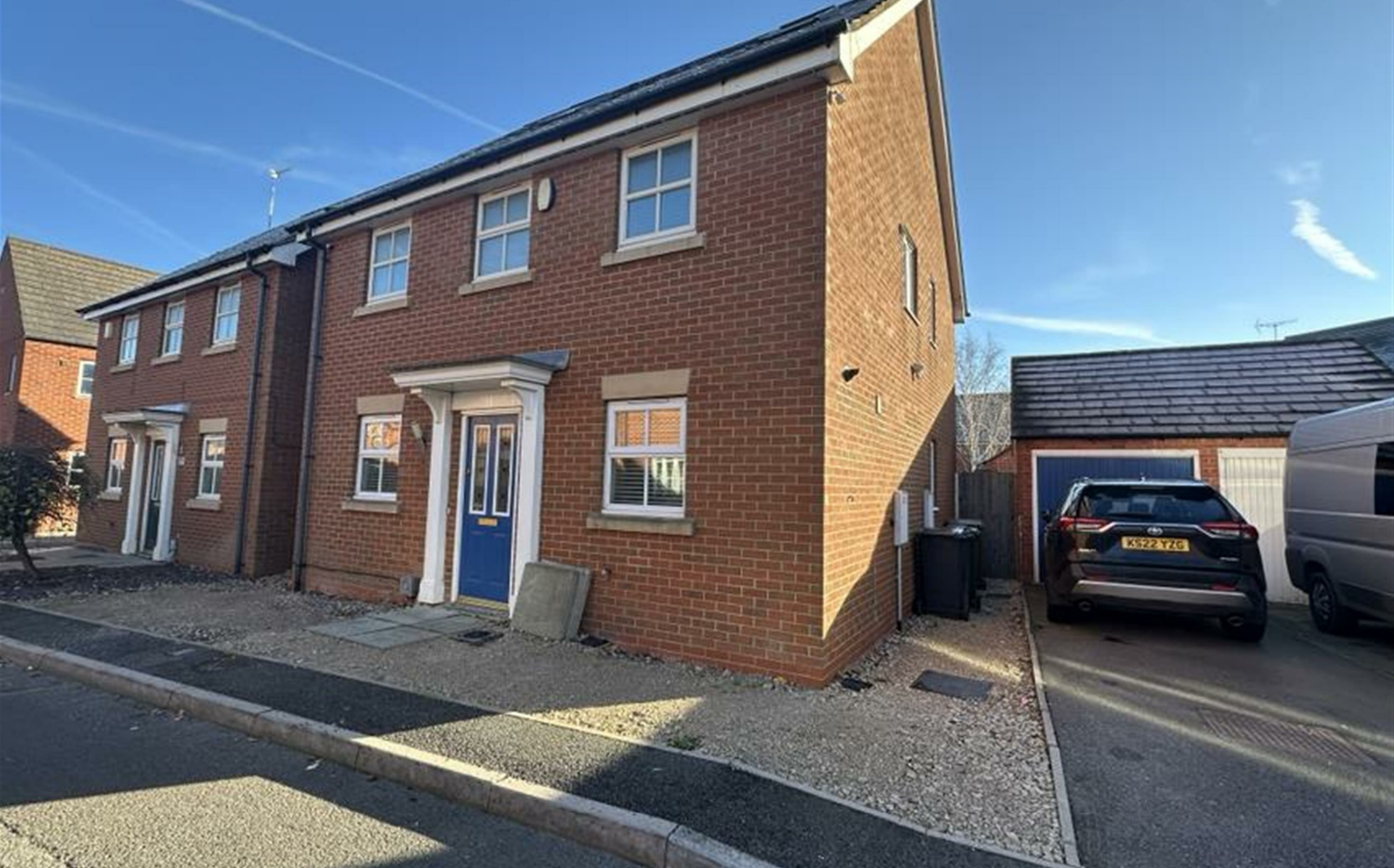
9 Victoria Drive Swadlincote, DE11 8DY £325,000