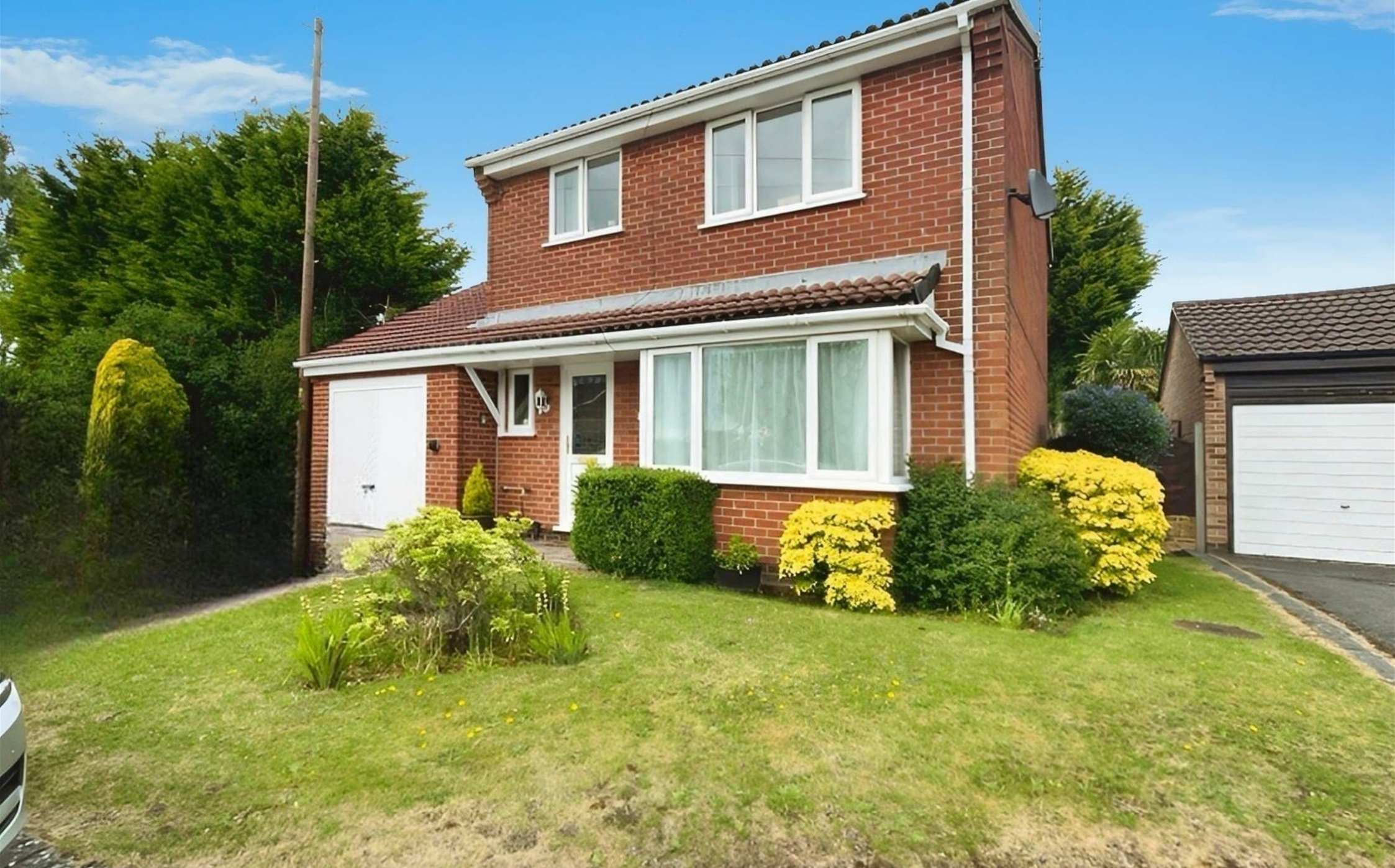
14 Topmeadow Swadlincote, DE11 0XG £299,500