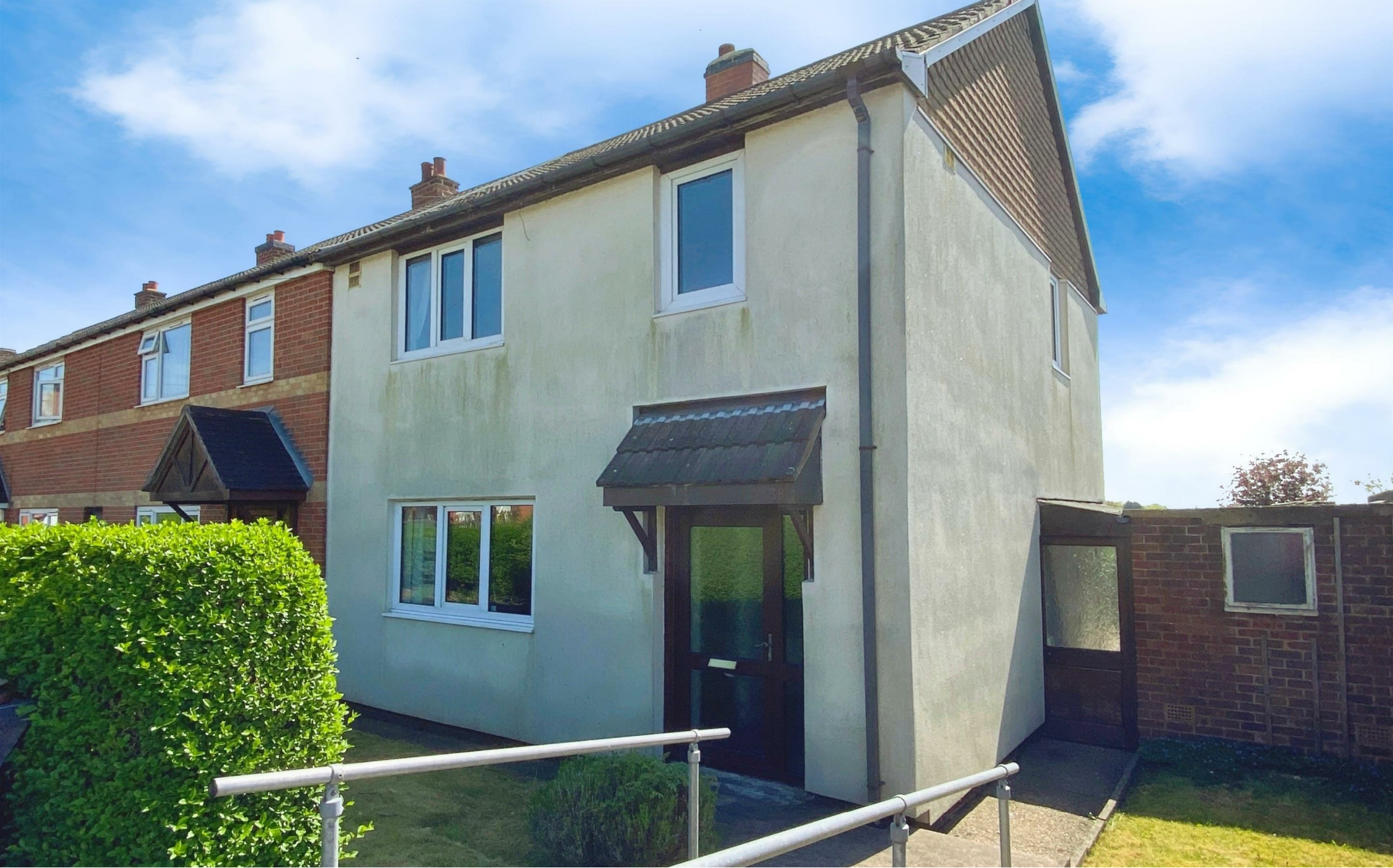
38 Stretton View Oakthorpe, Swadlincote, DE12 7QZ £180,000