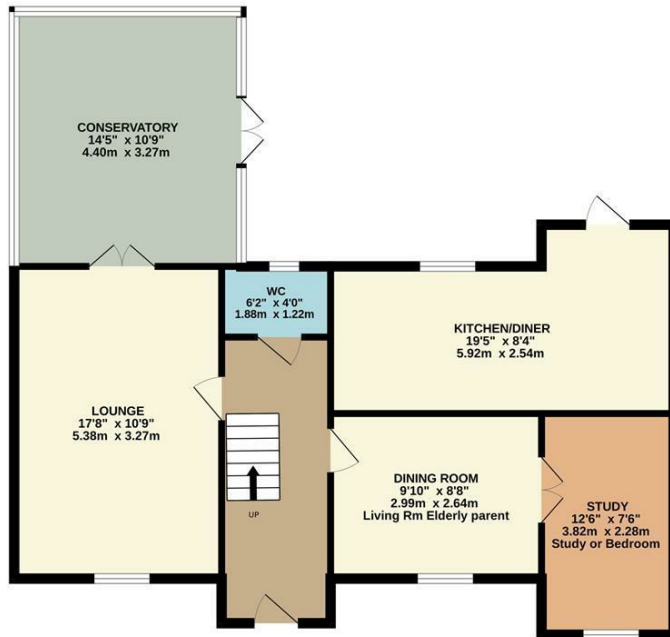
1ST FLOOR 541 sq.ft. (50.3 sq.m.) approx.