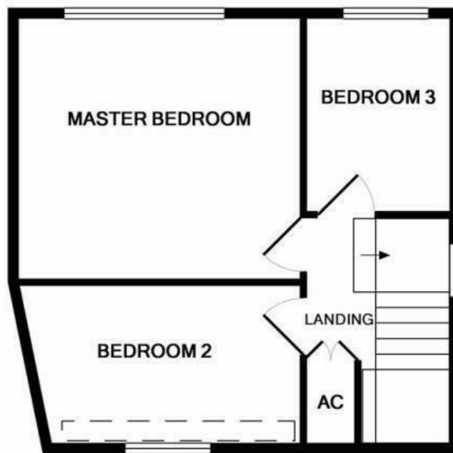
1ST FLOOR APPROX. FLOOR AREA 377 SQ.FT. (35.0 SQ.M.)