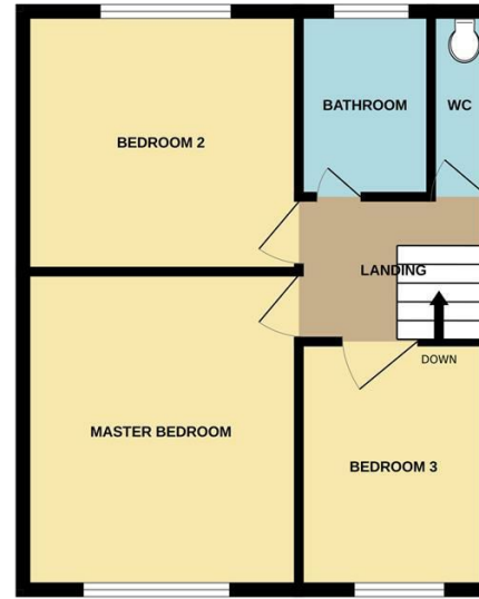
1ST FLOOR 437 sq.ft. (40.6 sq.m.) approx.