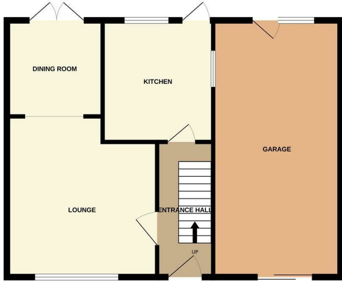
GROUND FLOOR 707 sq.ft. (65.7 sq.m.) approx.