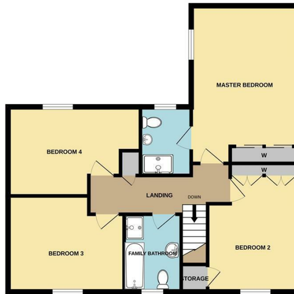
1ST FLOOR 784 sq.ft. (72.8 sq.m.) approx.