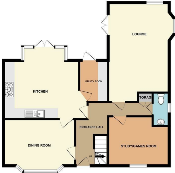
GROUND FLOOR 813 sq.ft. (75.5 sq.m.) approx.