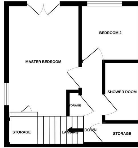
1ST FLOOR 262 sq.ft. (24.4 sq.m.) approx.