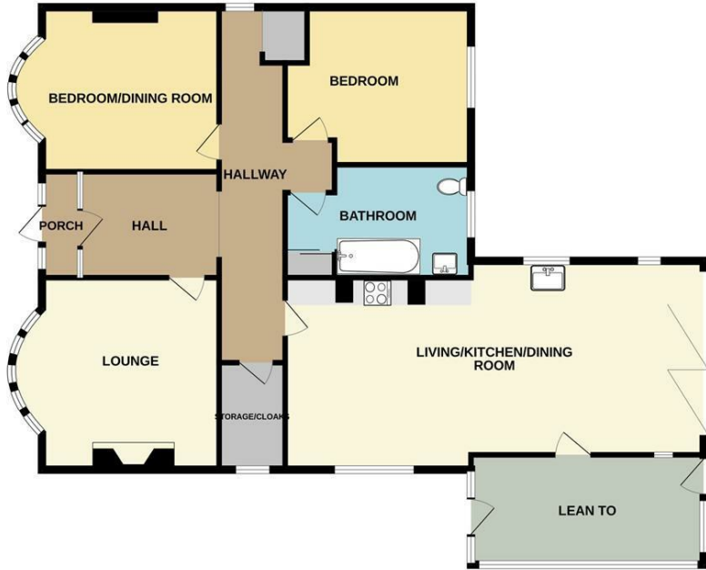
GROUND FLOOR 1367 sq.ft. (127.0 sq.m.) approx.