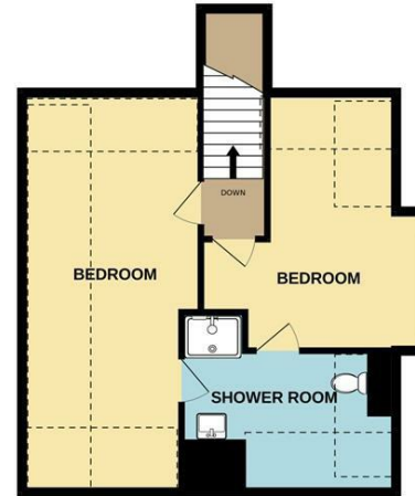
1ST FLOOR 530 sq.ft. (49.3 sq.m.) approx.