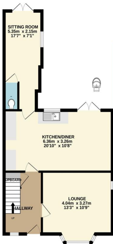
GROUND FLOOR 52.8 sq.m. (568 sq.ft.) approx.