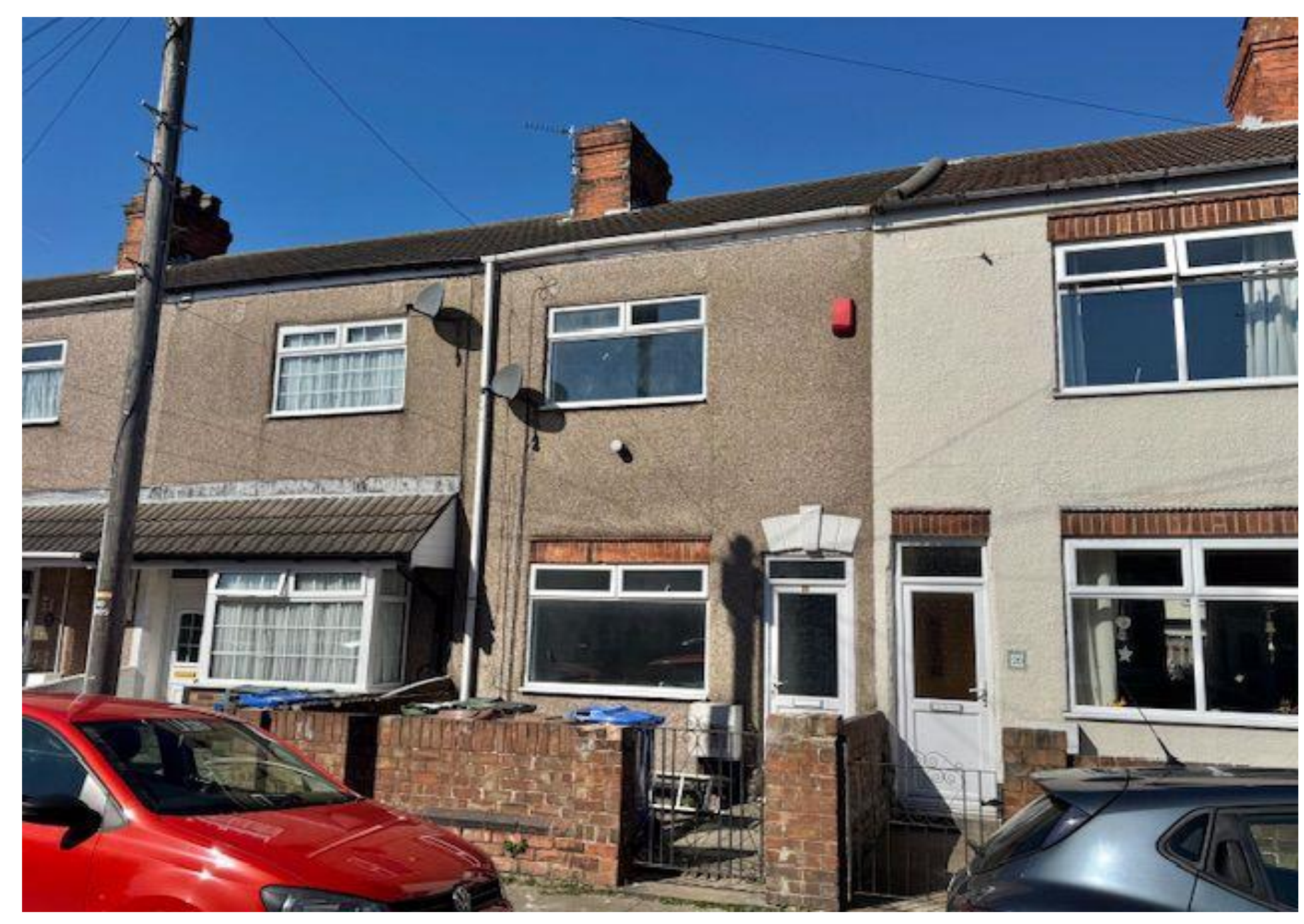
Tiverton Street, Cleethorpes, DN35 7PR