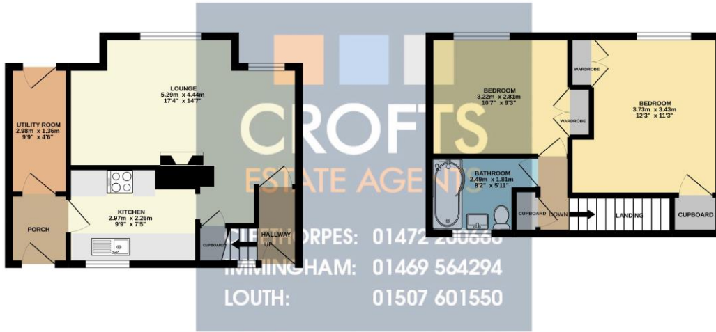
1ST FLOOR 30.8 sq.m. (331 sq.ft.) approx.

TOTAL FLOOR AREA: 62.8 sq.m. (676 sq.ft.) approx.