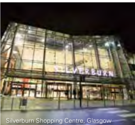
Silverburn Shopping Centre, Glasgow