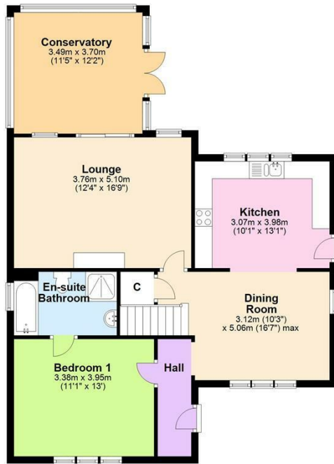
Ground Floor Approx. 100.0 sq. metres (1076.0 sq. feet)