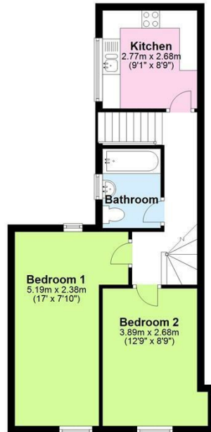
First Floor Approx. 44.6 sq. metres (480.0 sq. feet)