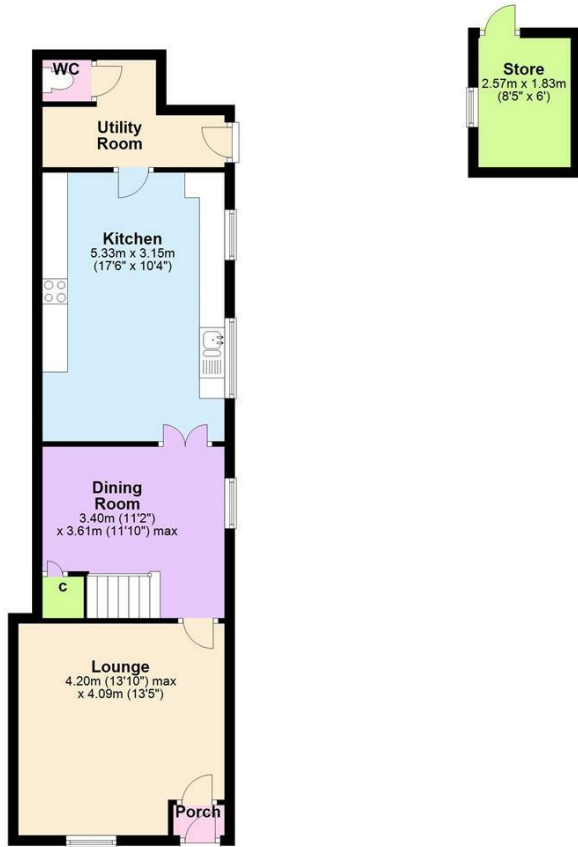
Ground Floor Approx. 60.7 sq. metres (653.8 sq. feet)