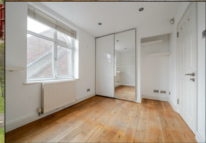
Lullington Garth, Woodside Park, N12 7BT Guide Price £250,000 Leasehold Council Tax Band C