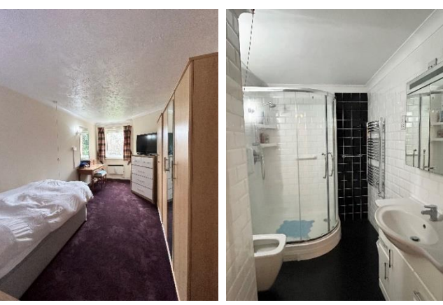
Please note: Some furniture items have been removed from the property