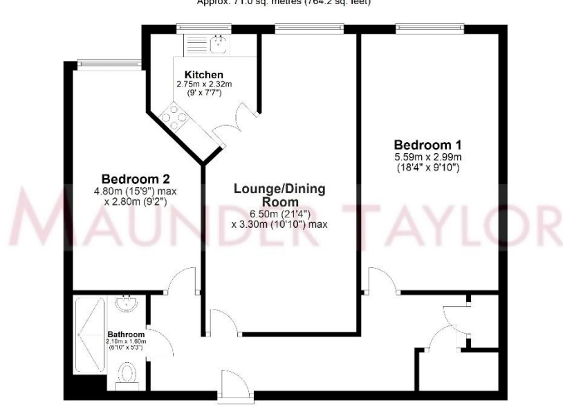
Total area: approx. 71.0 sq. metres (764.2 sq. feet)

Floor Plan measurements are approximate and are for illustrative purposes only. While we do not doubt the floor plans accuracy, we make no guarantee, Plan produced using PlanUp.