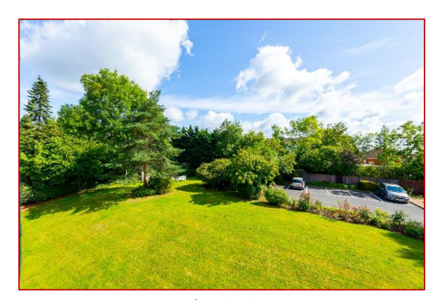
view from bedroom

Current service charge: £2,566.38 half yearly-Ground Rent - £291.04 half yearly Council Tax Band: E